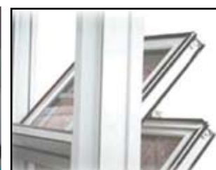
Interlocking sashes seal cold drafts out.

Foam does NOTHING to prevent cold from traveling across vinyl walls. Tests have shown there is no difference with foam filled air chambers. Cold travels along vinyl, NOT air chambers.