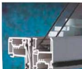
Triple Weatherstripped. More weatherstripping means less air leaks.

Our beefy triple weatherstrip on the sash reduces air infiltration. Our Ultra Sonic Welded fibers on the weatherstrip keep cold out longer. Reinforced shoulders on base of weatherstrip help keep fibers straight to keep the cold out. Interlocking sashes reduce air infiltration and add security. Pocket sills add 90 degree angles which cuts air infiltration.