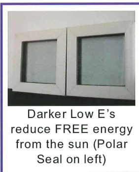
Darker Low E's reduce FREE energy from the sun (Polar Seal on left)

Silicone foam air spacer separates inner and outer pane of glass so cold can't transfer in quickly like metal spacers. Conducts 100 times less temperature than other "warm edge" steel spacers, reducing the chance of condensation, sweat or mold on your brand new windows.