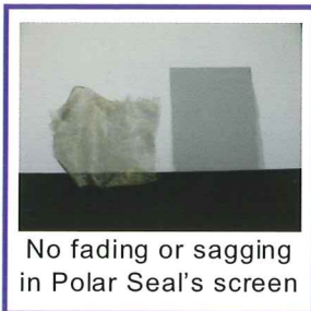
No fading or sagging in Polar Seal's screen