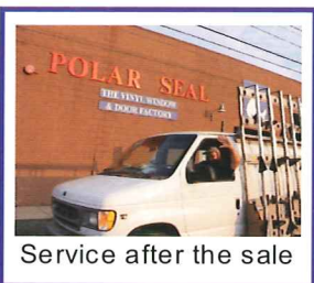
Service after the sale

Thicker glass resists breakage better and lays flatter than single strength, reducing awkward concave reflections. Go ahead, knock on our glass and compare it to the others.