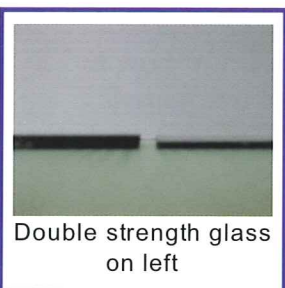
Double strength glass on left

Choose from 3 main colors (white, tan or earthtone), add 4 real wood-look interior options (Light Oak, Dark Oak, Cherry or Paintable/Stainable Simulated Oak), and 7 exterior color options (white, tan, earthtone, green, clay, terratint, bronze and coming spring '04 gray!)