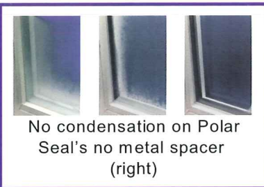
No condensation on Polar Seal's no metal spacer (right)

More walls and thicker walls means less chance for cold winter winds to seep in through your windows. More chambers help insulate; even as well as foam filled frames insulate...it's proven in test results!