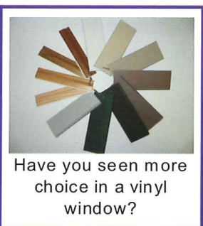
Have you seen more choice in a vinyl window?

90 Degree angles make it tougher for air to penetrate.. However, most forget this feature at the sill. By sinking the sashes into deep pocketing jambs and sills, air's chances of getting in to your home are slim to none.