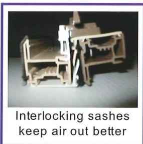
Interlocking sashes keep air out better

Sure, it's tougher to get aluminum wire screens installed in the home without denting them (that's why we package them separately), but once they are installed, they won't sag, fade and deteriorate like fiberglass screen wire.