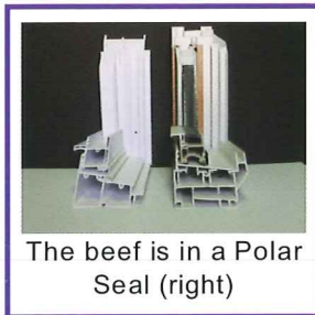
The beef is in a Polar Seal (right)